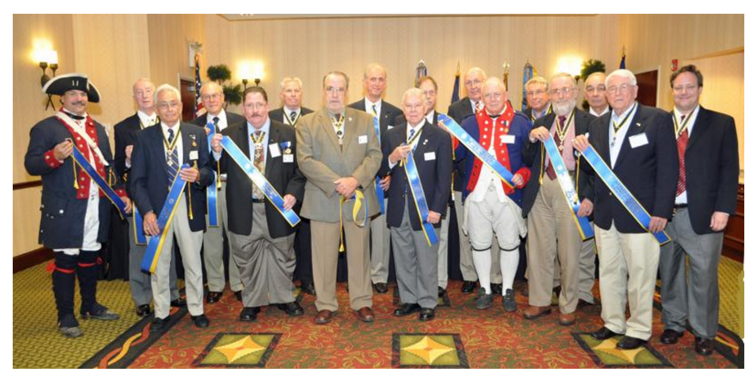
A highlight of the Semi-Annual Meeting in Winchester was the presentation of a special streamer to fifteen Chapters and the State Society for attending the special Plaque in the Valley program near Raphine in May. (See AWARDS on page 6)