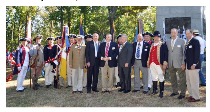
The Virginia Society was well represented by primary and dual members at the 230<sup>th</sup> Anniversary of the Battle of Kings Mountain in South Carolina on October 7.