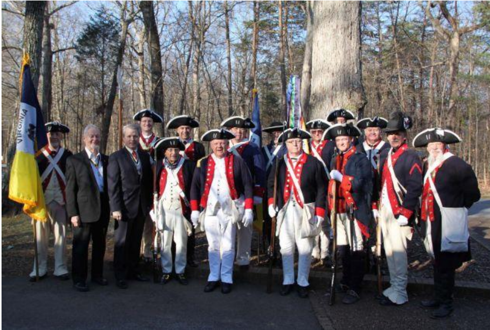
VASSAR Color Guard gathered at Guilford

The observance program of the 233 rd anniversary of the battle of Guilford Courthouse was held on March 15, 2014 at the Guilford Courthouse National Military Park located in Greensboro, North Carolina.